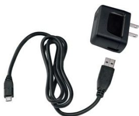
Micro USB cable Standard