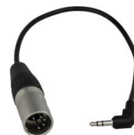
DMX Adapter ART7-ADP