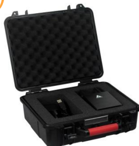
Carrying Case ART7-CSE